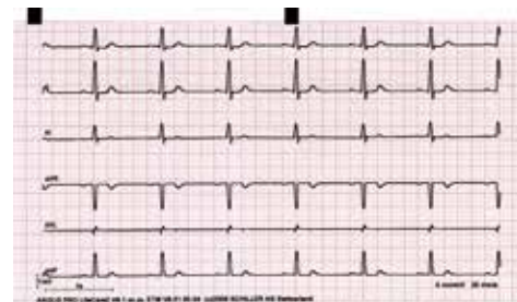
12 leads in the resting ECG display

2 USB INTERFACES: Export of intervention data to a USB memory stick, saving and loading device configurations, software update