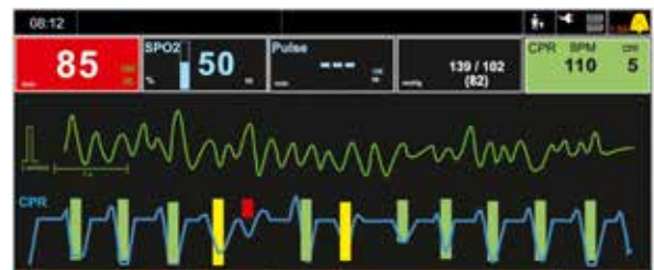
Colour-coded CPR assistance through the ARGUS LifePoint

* Recoil not available in the UK, France, Germany and USA.