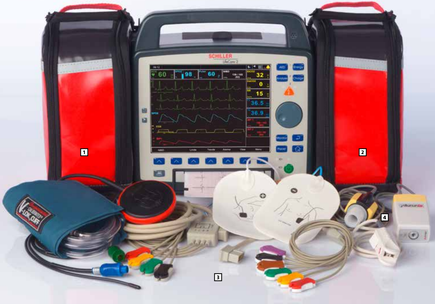
1 Left lateral pouch: ECG, NIBP, electrodes, left paddle, LifePoint