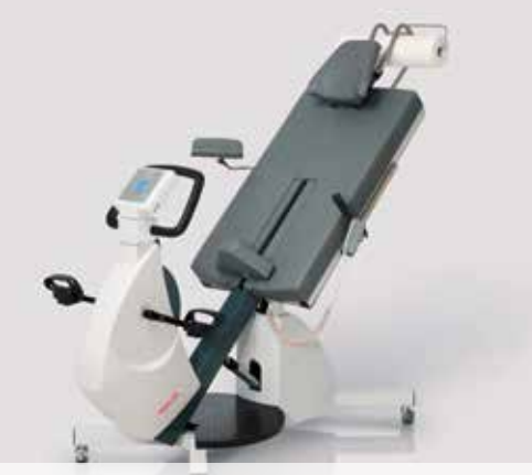
ERG 911 L: couch/semi-couch safety ergometer, infinitely variable from 0^{\circ} - 45^{\circ}